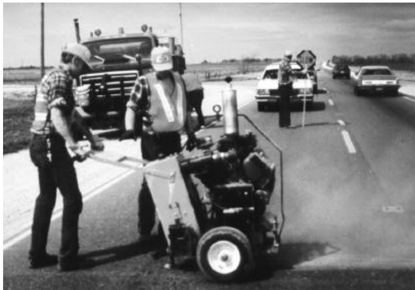
Figure 8. Diamond-blade crack saw.