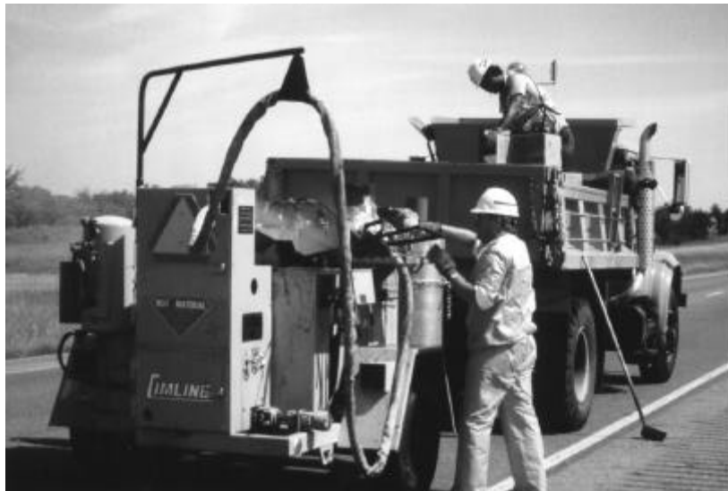
Figure 13. Asphalt kettle with pressure applicator.

Rubber- and fiber-modified asphalt materials must be heated and mixed in indirect-heat, agitator-type kettles. These machines burn either propane or diesel fuel, and the resulting heat is applied to a transfer oil that surrounds a double-