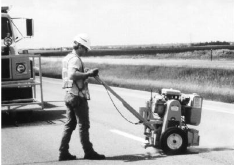
Figure 7. Rotary-impact router.