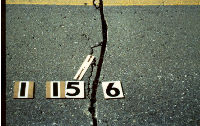
Figure 17. Crack segment missed by cutting equipment.

If a secondary crack is encountered along a primary crack, such as that shown in figure 18, a decision must be made as to whether to cut it. Two closely spaced channel cuts can significantly weaken the integrity of the AC along that particular segment. A general rule is to cut only secondary cracks spaced farther than 300 mm from a primary crack. Secondary cracks closer than 300 mm should be cleaned and sealed only.