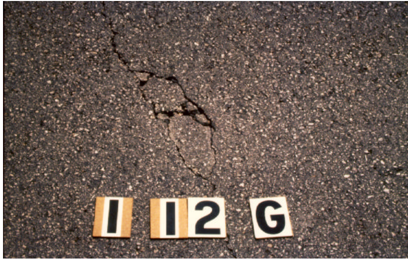
Figure 18. Primary crack accompanied by secondary crack.

Crack-cleaning operators are likely to encounter some loosened AC fragments while cleaning, particularly if cracks are cut. Operators should remove these fragments because they will be detrimental to sealant or filler performance. If the cleaning equipment is unable to remove these fragments, they should be removed manually with hand tools.