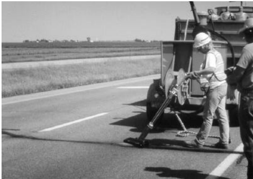
Figure 10. Hot airblasting using HCA (heat) lance.