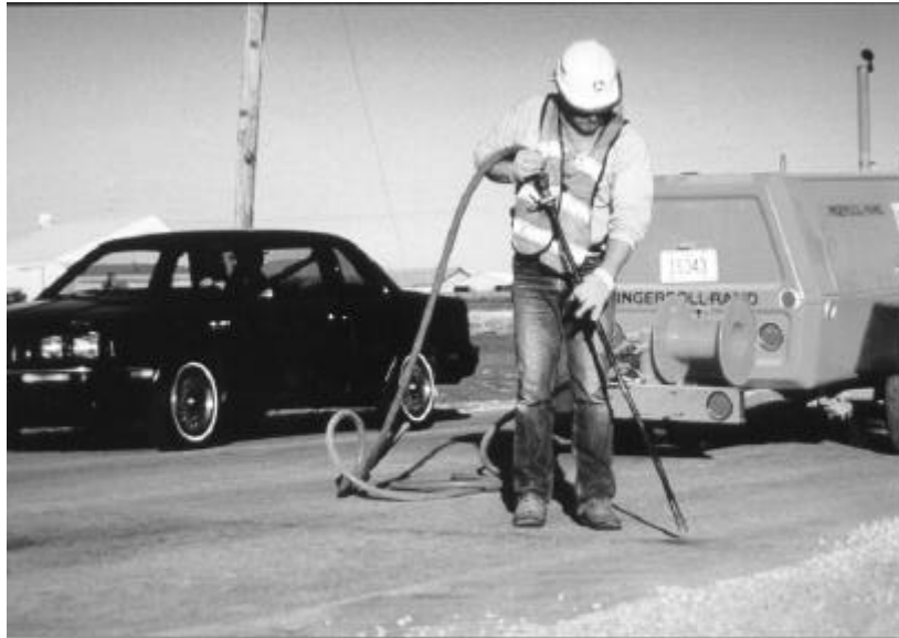
Figure 9. High-pressure airblasting using compressed air.