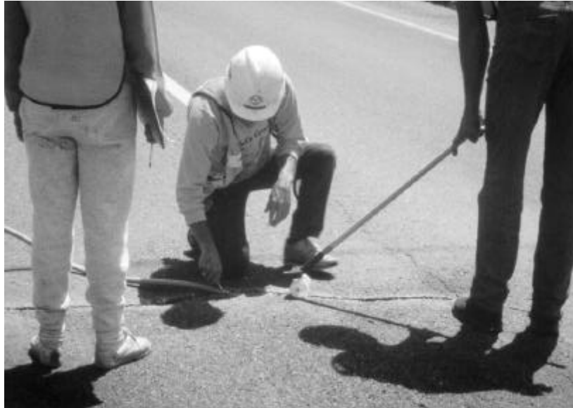
Figure 12. Backer rod installation tool.