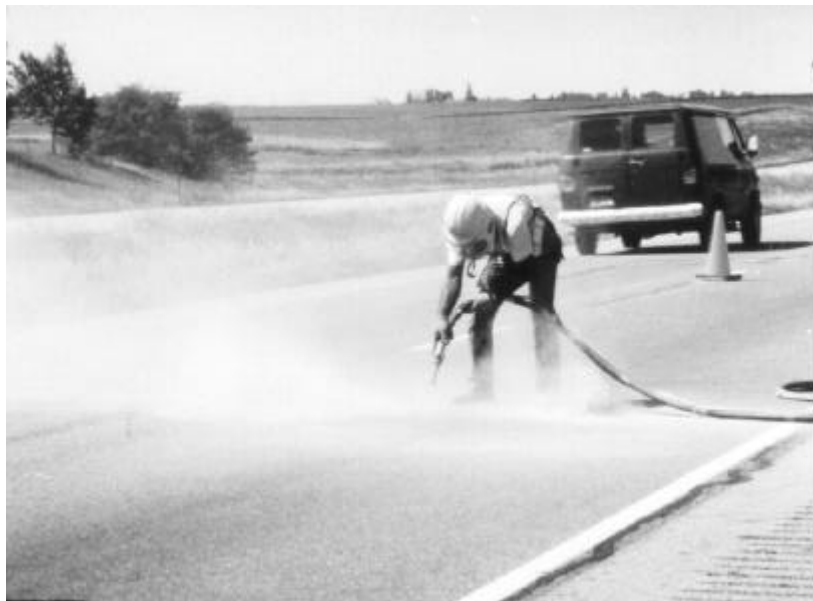
Figure 11. Sandblasting operation.

Sandblasting equipment consists of a compressed-air unit, a sandblast machine, hoses, and a wand with a Venturi-type nozzle. A second air compressor is often necessary for follow-up cleaning after the sandblasting operation.