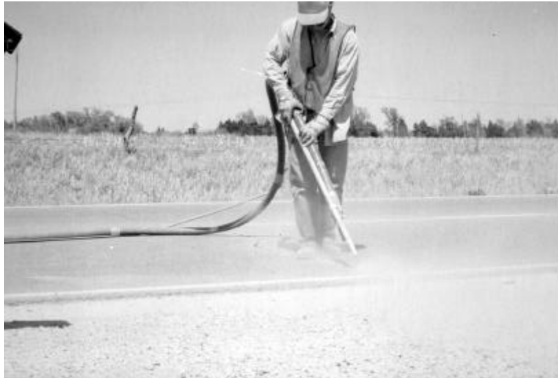
Figure 19. Sandblasting wand with wooden guide attached.

As with saws and routers, most mechanical wirebrushes have actuator-type depth-control switches. The absence of depth gauges, however, usually requires frequent setting adjustments for optimal cleaning of each new crack.