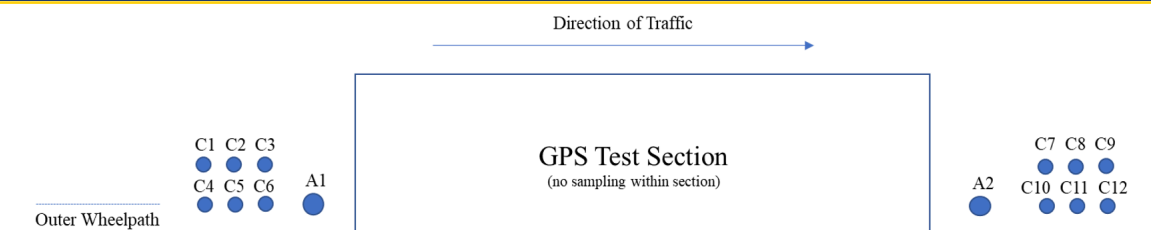
Figure 4. Illustration. Depiction of sampling for asphalt layers for a GPS test section (Afsharikia, Rada, and Groeger 2022).

“In the mid-2000s, I struggled with LTPP data wrangling and filling data gaps. The data were needed to perform the modeling in the FHWA High-Performance Concrete Paving (HIPERPAV6) software (Chang et al. 2008), which calculates the progression of the concrete’s strength gain and develops stresses at the early age after placement. The model inputs include materials, pavement structural information, construction, and environmental conditions. Today’s ARDs would have saved me a tremendous amount of time and effort,” said Dr. George Chang, P.E., Director of Research, The Transtec Group, Inc., and subject matter expert in support of the LTPP ARD development effort.