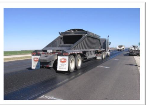
Belly-Dump Haul Truck used at the Texas SPS-10 test site.

The Texas Department of Transportation constructed the second project for the new SPS-10 experiment in February 2015 on U.S. Route 277, approximately 60 miles southwest of Wichita Falls. The project includes three core test sections. The State did not build any supplemental sections.