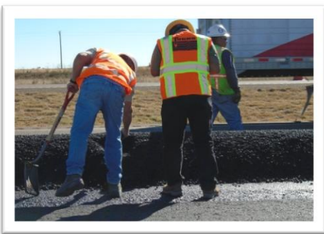
Field crew measures the temperature of the dropped asphalt concrete for the New Mexico SPS-10 site.

The New Mexico Department of Transportation constructed the first LTPP WMA project in November 2014 on Interstate 40, approximately 80 miles east of Albuquerque. The project includes three core test sections plus two supplemental sections. The supplemental sections will allow New Mexico to compare the performance of PG 70-22+ binder and the chemical additive, Cecabase®, to those used in the core sections, PG 70-22 binder and Evotherm®, the chemical additive.